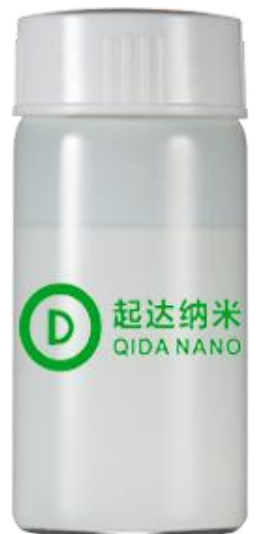
SZ101Nano Zinc Oxide Solution