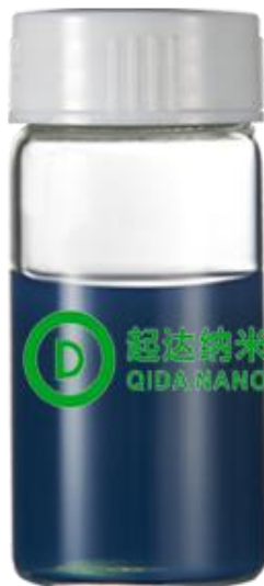
SH101Nano Indium Tin Oxide Solution(ITO)