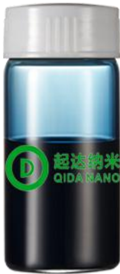
SW101Nano Tungsten Oxide Solution(WO 3 )