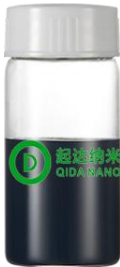
SA101 Nano Antimony Tin Oxide Solution(ATO)