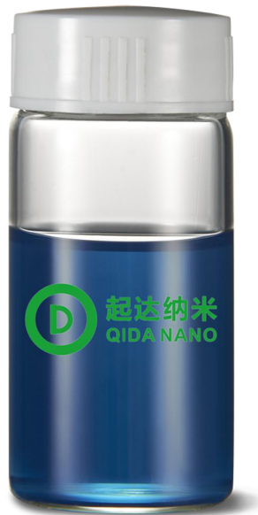
Fig1. GW101 real product photo show

GW101 is light blue full transparency, high hardness, super thermal insulation of liquid material, construction quick and easy, coating non toxic, with specially strong penetration can be permanently attached to the glass surface, the best way to compliance option can be widely used in architectural glass(curtain wall), automotive glass, train glass and so on, it can make normal glass get heat insulation effect, energy saving and environment friendly.