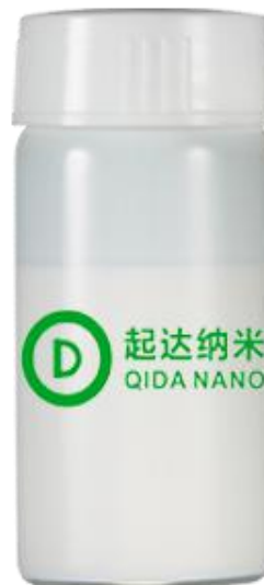
ST101Nano Titanium Dioxide Solution