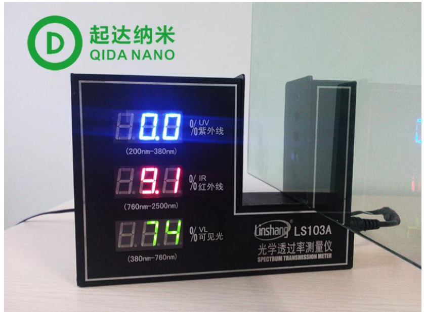
Fig2.After coated the glass with GW101,UV cut rate 100%,IR cut rate above 90%and VLT(Visible Light Transmittance)is 74%tested by spectrum transmission meter(950nm).